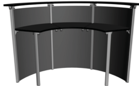
Step 3. Attach transaction tops. (end tops have 2 holes at termination end)