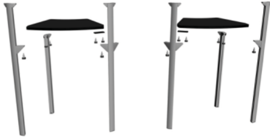
Step 1. Assemble left and right ends.